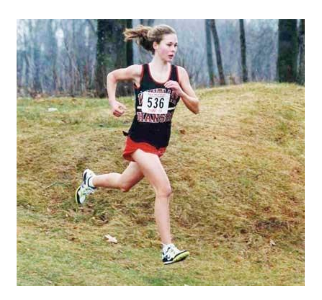
Part I: The Departure